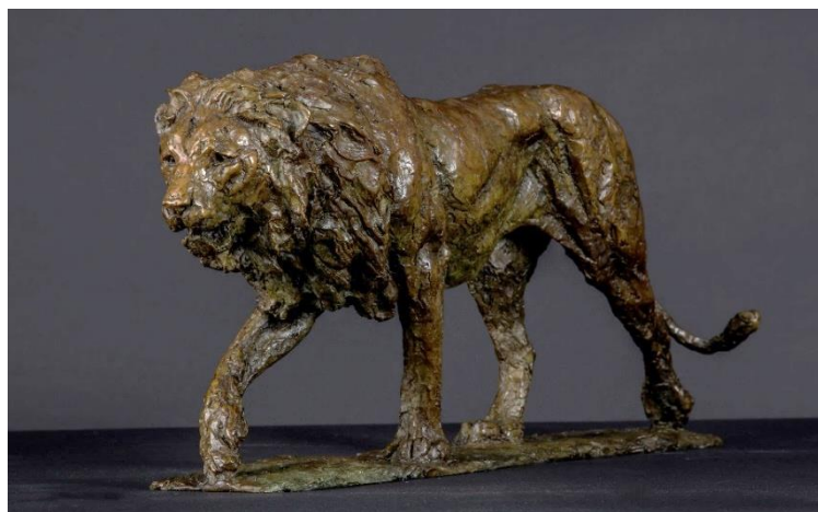
Walking Lion, Bronze Ed. 12

Coningsby Gallery, 30 Tottenham Street, London W1T 4RJ