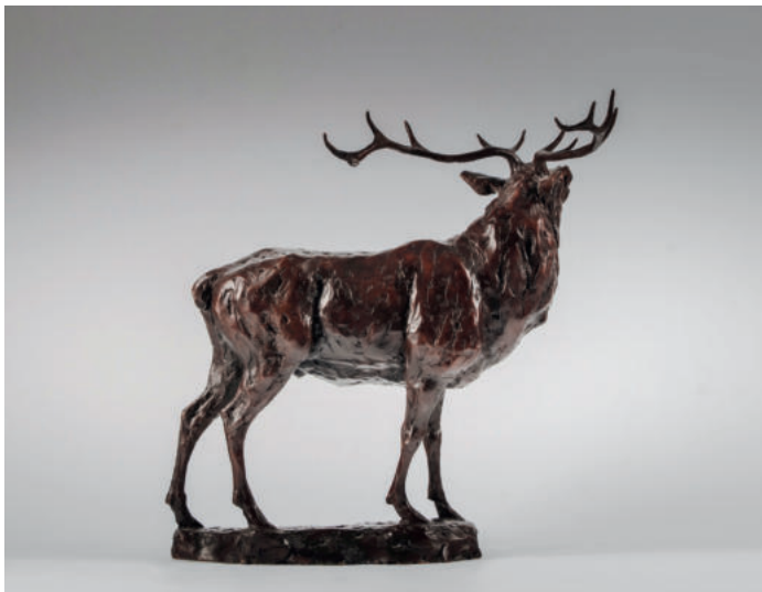
19 Bellowing Stag Bronze, edition of 12, 41 x 44 x 26 cm