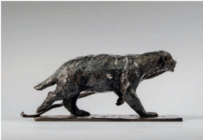
6 Honey Badger with Mole Snake Bronze, edition of 12, 43 x 18 x 16 cm