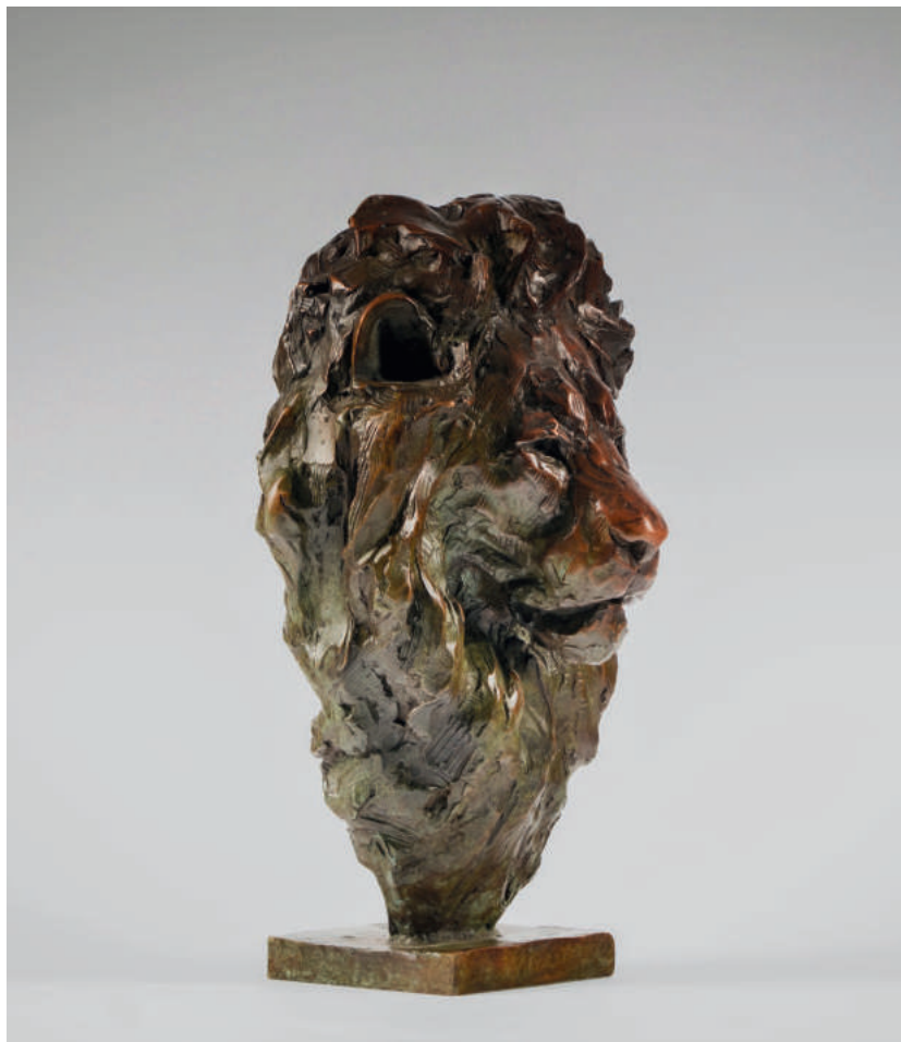
7 Lion Bust Bronze, edition of 24 x 38 x 12 cm