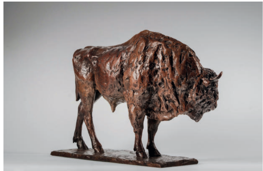
20 European Bison Bronze, edition of 12, 38 x 60 x 23 cm