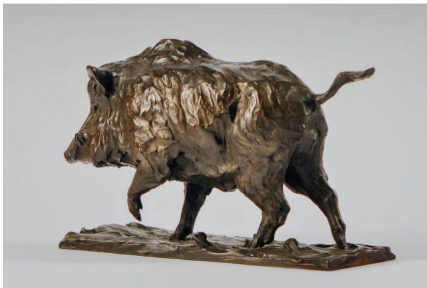
14 Wild Boar Bronze, edition of 12, 38 x 20 x 15 cm