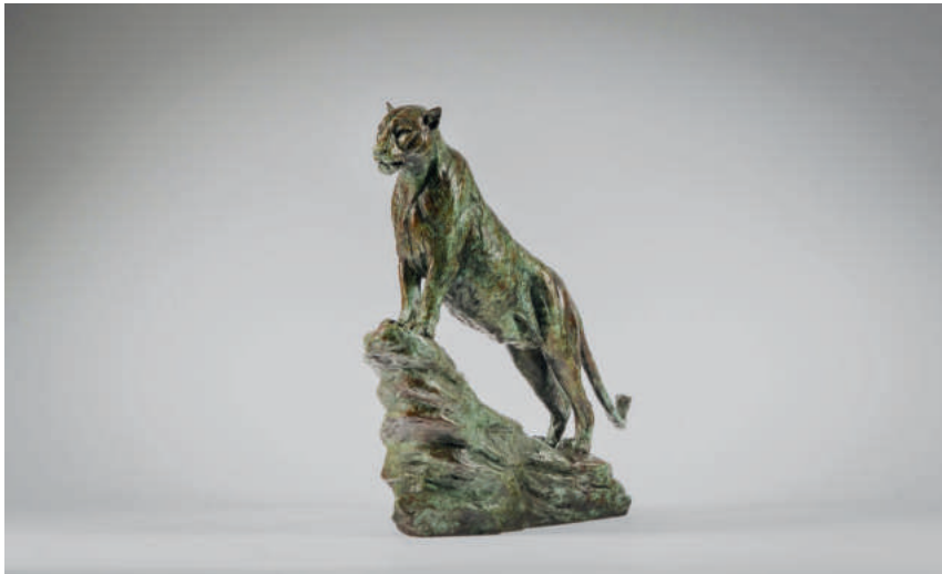
2 Leopard on Rock Bronze, edition of 12, 47 x 43 x 15 cm