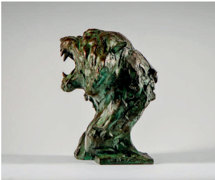
10 Tiger Roar Bronze, edition of 12, 30 x 35 x 25 cm