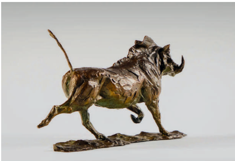
8 Running Warthog Bronze, edition of 12, 42 x 25 x 15 cm