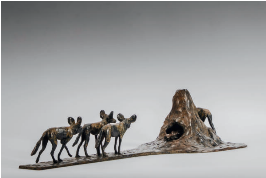
3 Wild Dog and Warthog Encounter Bronze, edition of 9, 82 x 30 x 23 cm