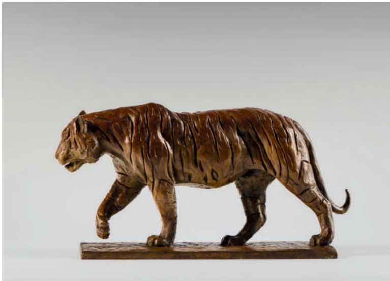
11 Walking Tigress Bronze, edition of 12, 40 x 20 x 12 cm