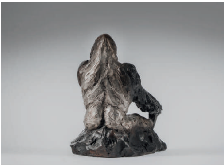
13 Mountain Gorilla Bronze, edition of 12, 35 x 25 x 33 cm