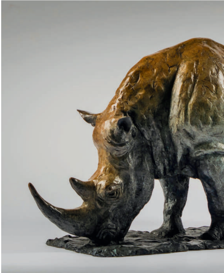
9 White Rhino Bronze, edition of 12, 75 x 25 x 35 cm