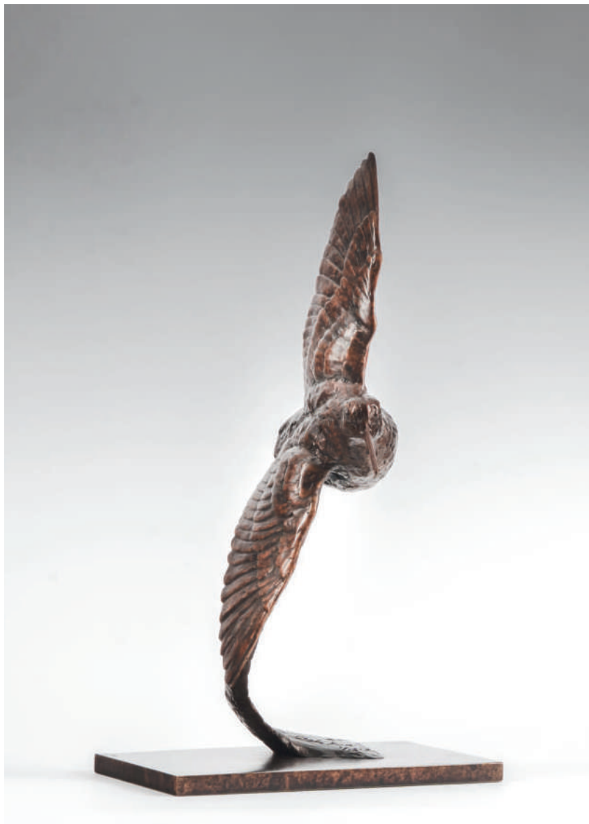
22 Woodcock Bronze, edition of 12, 59 x 33 x 40 cm