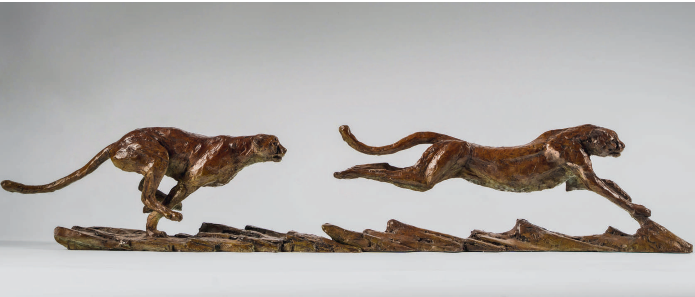
17 Sprinting Cheetahs Bronze, edition of 12, 103 x 26 x 14 cm