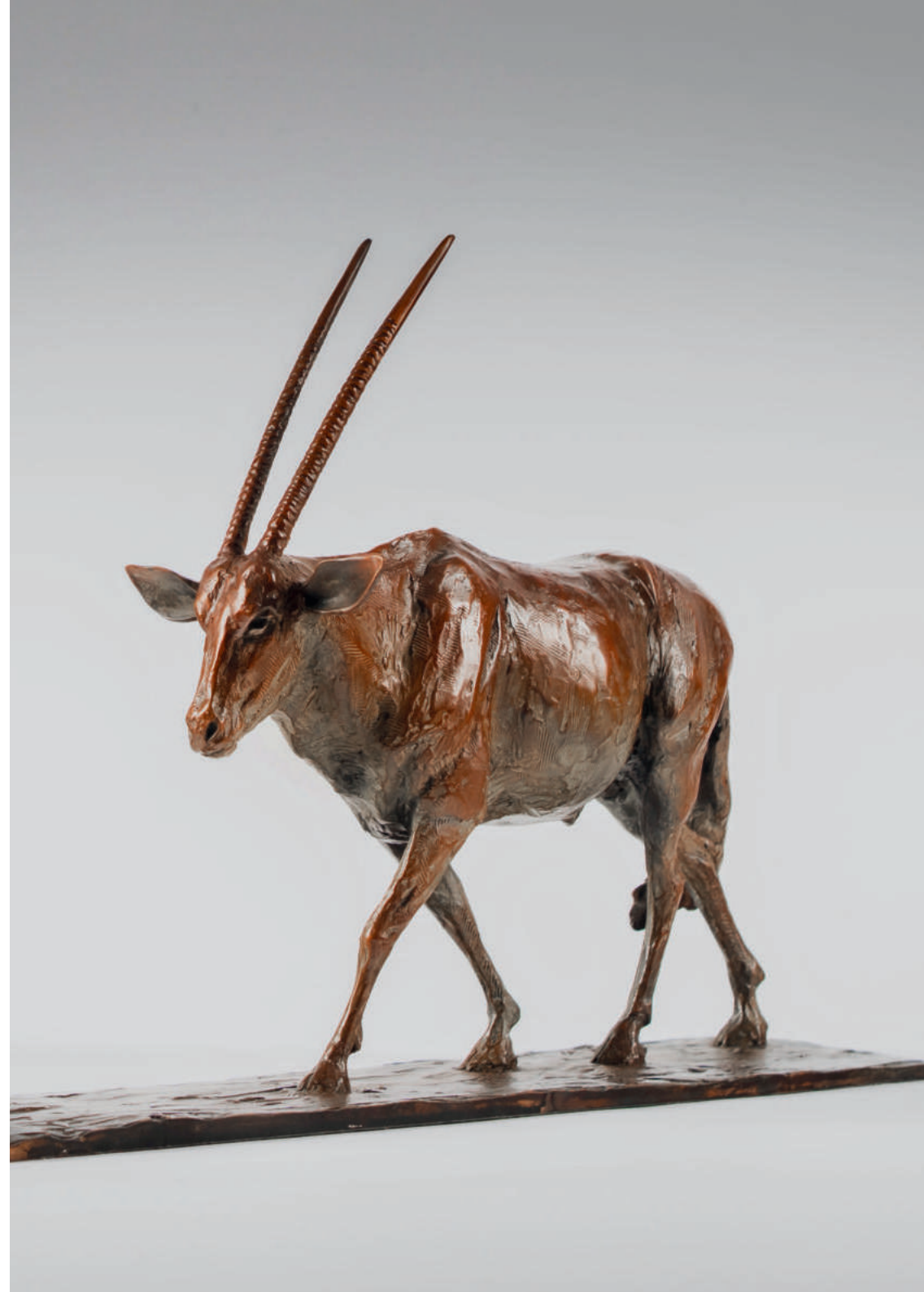
5 African Oryx Bronze, edition of 12, 34 x 32 x 10 cm