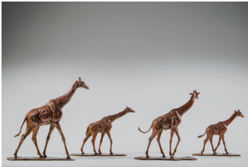
4 Giraffe Family Bronze, 120 x 42 x 15 cm