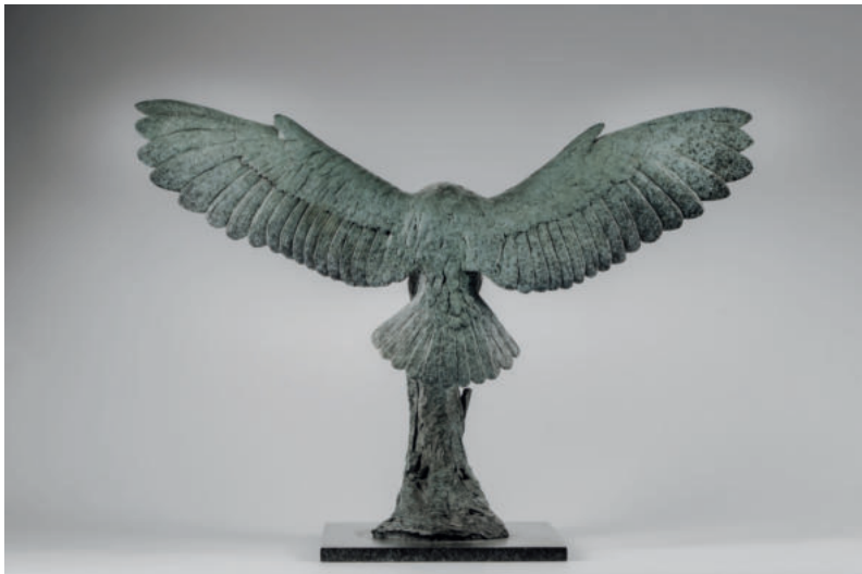
16 Landing Barn Owl Bronze, edition of 12, 83 x 56 x 30 cm