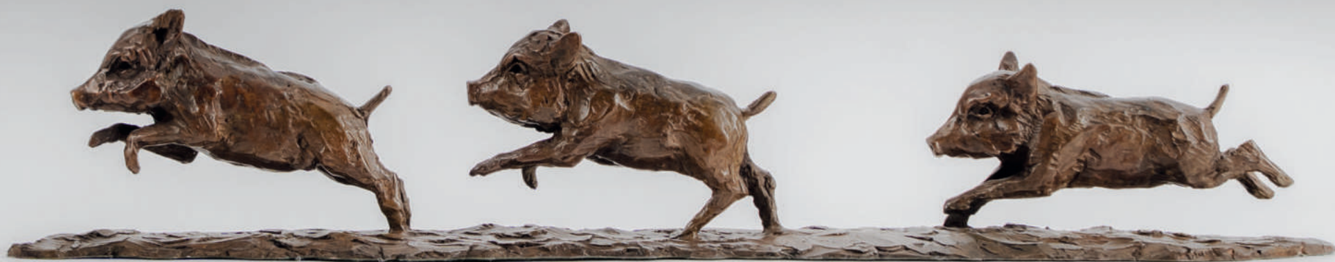
15 Running Boarlet Trio Bronze, edition of 12, 53 x 10 x 11 cm