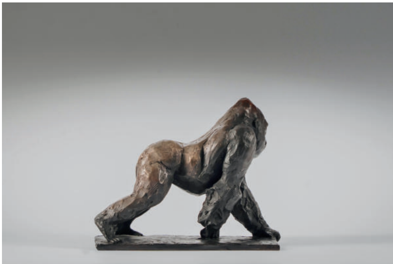
12 Silverback Bronze, edition of 12, 35 x 26 x 22 cm