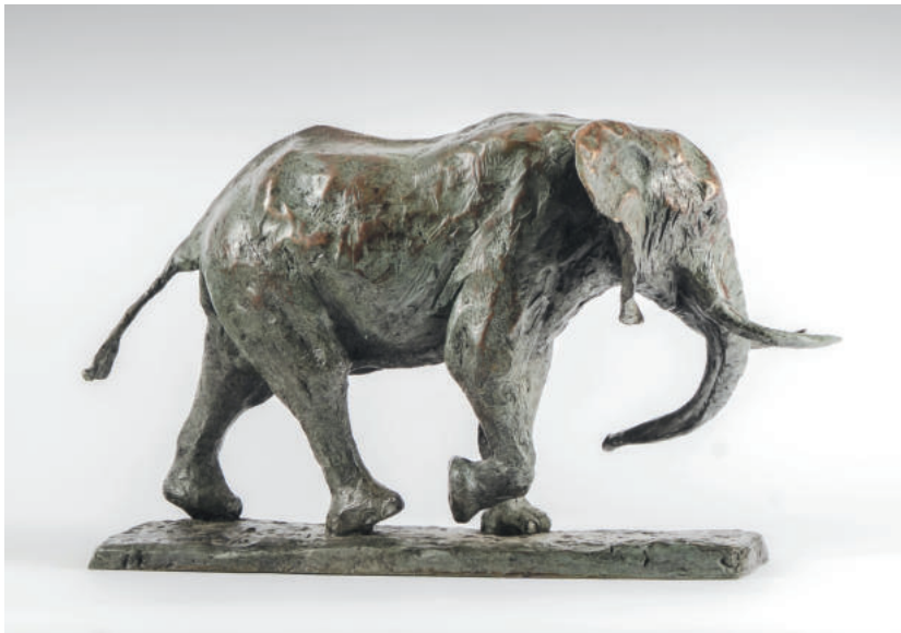
21 African Elephant Bronze, edition of 12, 60 x 35 x 28 cm