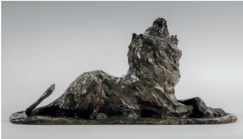
1 Yawning Lion Bronze, edition of 12, 55 x 27 x 21 cm